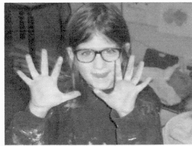
Infants Muck, Mess and Mixtures Morning