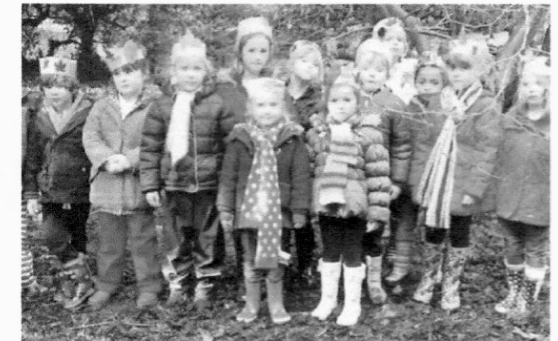
Infant Visit to Harcourt Arboretum