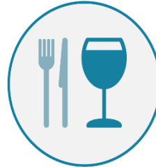
Restaurants and pubs